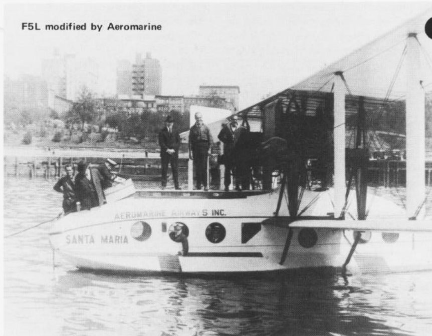
F5L modified by Aeromarine

Another seaplane which rivaled the S-23C was the Boeing 314. It weighed 82,500 pounds and could carry 74