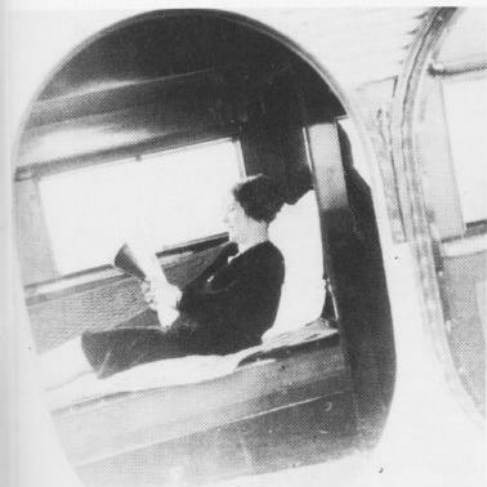
Berth in a Ford Tri-Motor

Not surprisingly, WW II disrupted normal air transport, especially long-